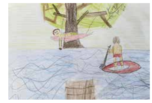
Jesko. 25th anniversary Stamm Cassiopeia e.V.