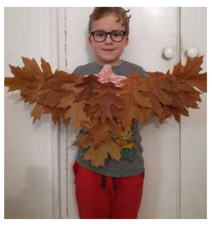
Totem of Eagle patrol from leaves

The main" driving force" here were especially young leaders who had very good ideas and, most importantly, they were able to implement them.