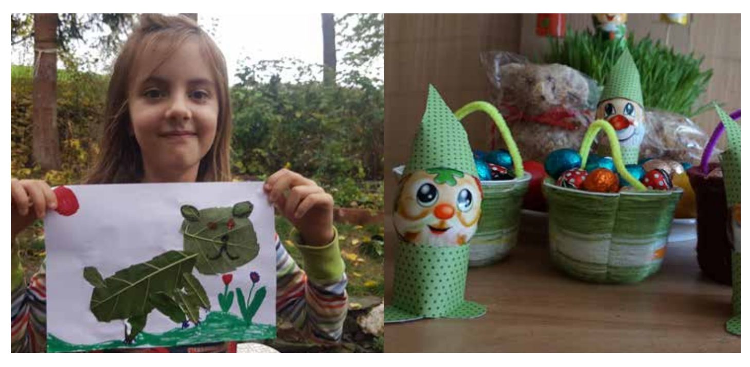
Beaver from autumn leaves

Meetings were moved to "google meets" and regular scout activities continued. Thanks to internet maps, we were able to "go" on an expedition to a castle or chateau or "walk" around the city. We played games together and we learned new