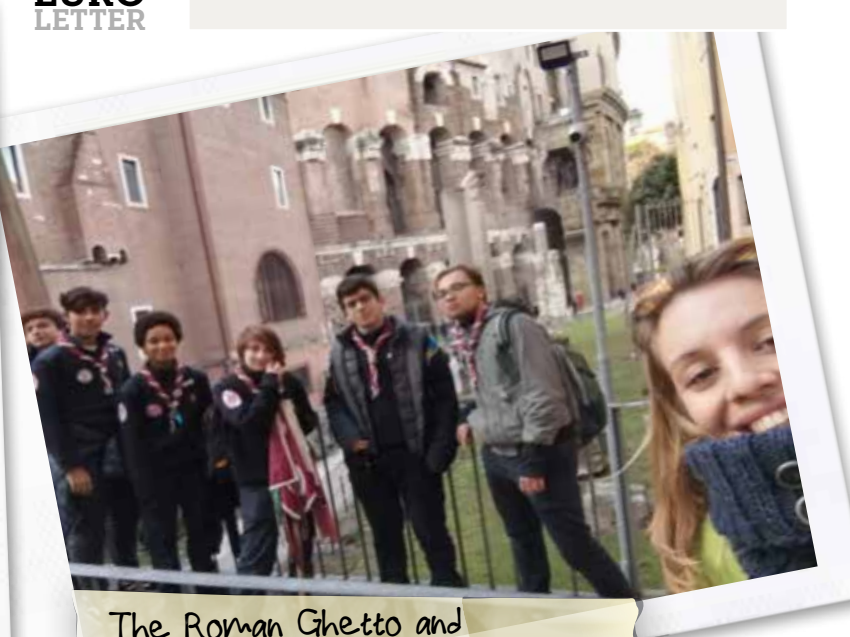
The Roman Ghetto and The Theatre of Marcellus